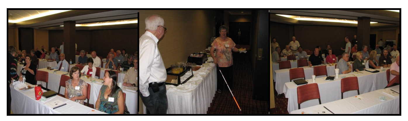
Houston Meeting, June 4, 2011

The opinions and statements expressed herein are those of the individual authors and do not necessarily reflect the viewpoints of the Association of Texas Appraisers or of its individual members.